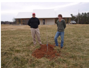
To add more diversity to the Cahoon Forest, members of Venture Crew 2831 reset a seedling from the famous Virginia Tech Bur Oak directly behind the CATC. It will be the slowest growing but by far the largest when it matures to a height of 75 ft with a spread of up to 100 ft to provide a large shaded program area behind the CATC. If you look carefully through the open doors of the CATC you can see the flagpole which stands in front of the facility.