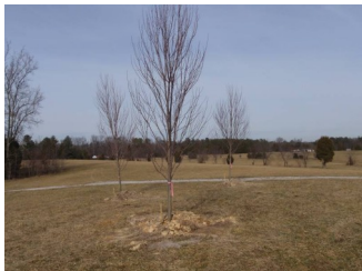
Nine Brandywine Maples (three pods of 3 trees each) - these grow to a mature height of 25 ft with a 12 ft width in about a dozen years the leaves turn deep red in fall eventually turning to a purple-red and remaining longer than most other maples

What Cahoon Forest you ask??? Well if you look carefully as you drive by the Cahoon Activity and Training center you will notice that it is now surrounded by trees, including maple, birch and oak. The photos below show the work in progress, which was finished just before the advancing rain made it to the Richmond area.