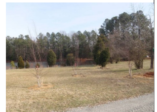
Six Heritage River Birch (two pods of 3 trees each)