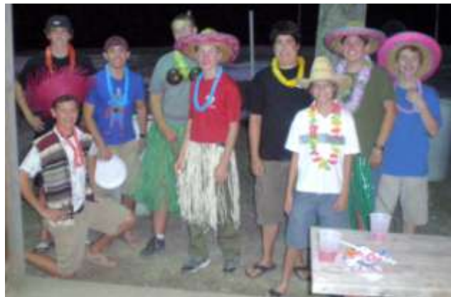
Mexican Luau/Hawaiian Fiesta Night - The Big Kahuna Piñata contest. Chapter members posing.

United Way, Combined Federal Campaign and other corporate donation campaign numbers!