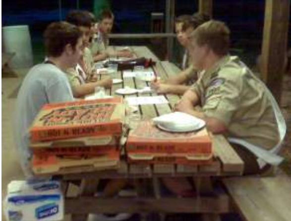
Chapter meeting "Pizza Night".