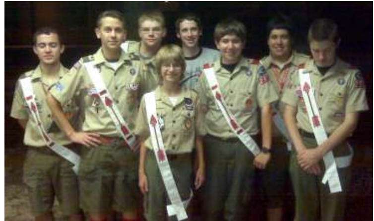
Chapter Takachsin group pose.